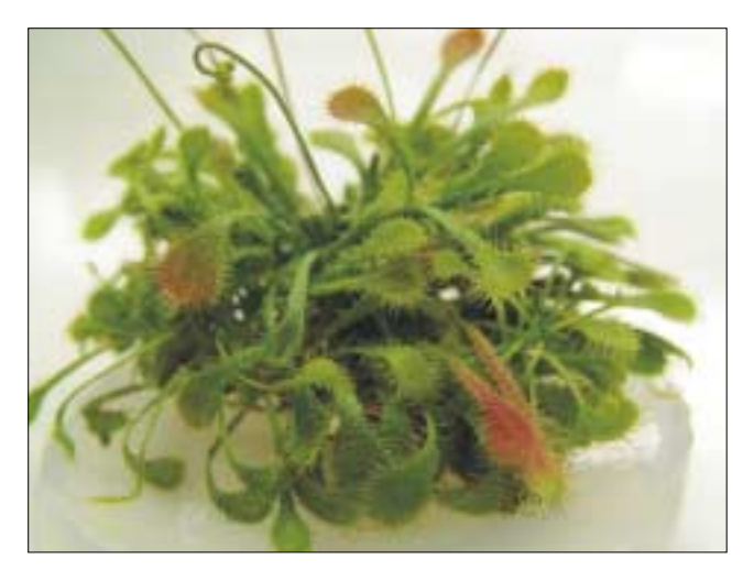
Fig. 2. Vegetative propagation of Drosera sp. in vitro

In experiments aimed to assess the regeneration abilities of selected Drosera species and Dionaea muscipula , a very high morphogenetic potential of the leaf and rosette explants was shown (Kukułczanka 1991). For example, Drosera rotundifolia leaf and leaf rosette explants annually produced 340 000 adventitious buds and 160 000 axillary rosettes, respectively. The results were achieved when RM medium (Reinert & Mohr 1967) was employed and BAP played the most important role in bud formation from rosette explants. The combination of cytokinin and auxin caused the increase in the number of buds and rosettes regenerated in leaf explant culture (Fig. 2).