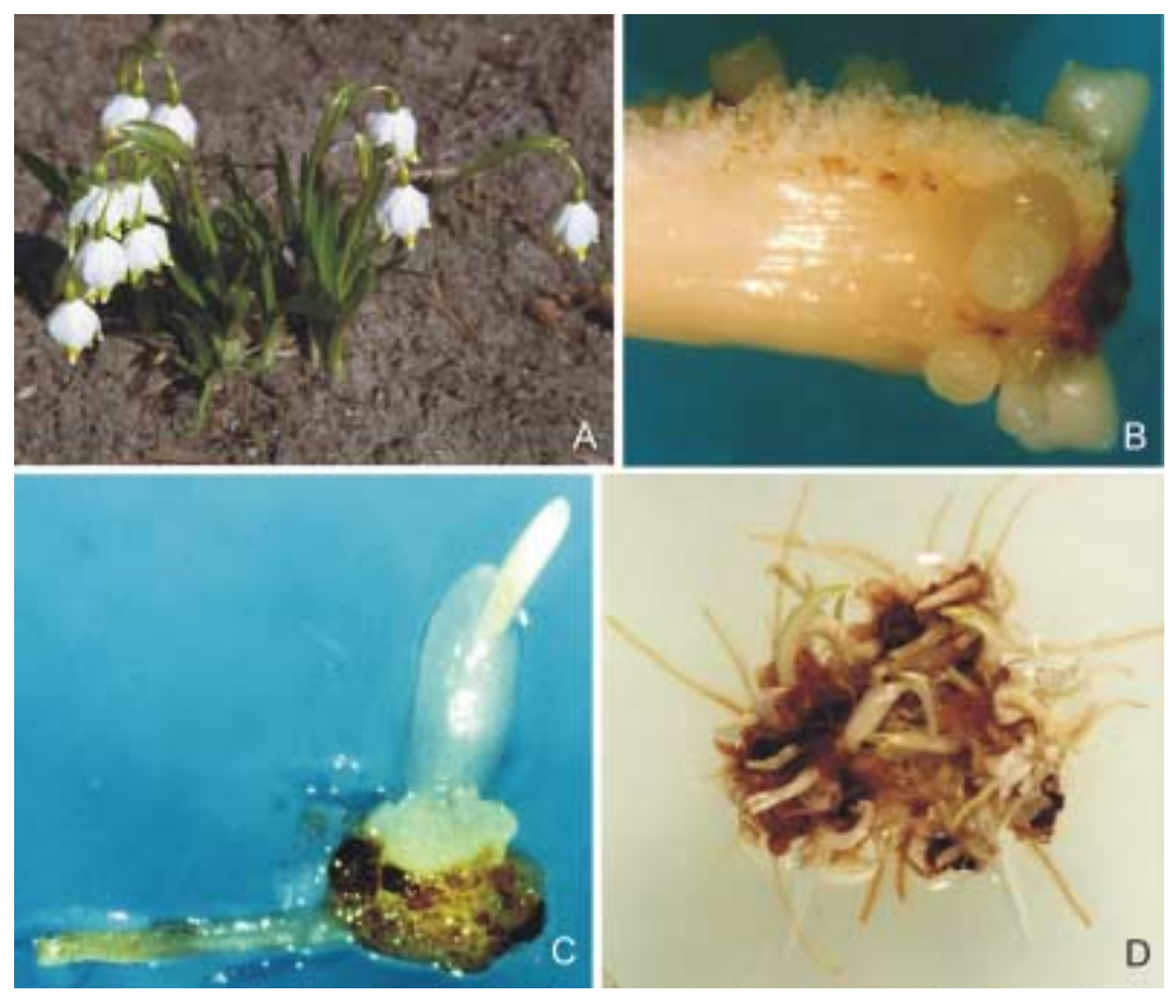
Fig. 3. Vegetative propagation of Leucoium vernum from bulb scales Explanations: A – general view of blooming plant; B – bulblet formation on the primary bulb-scale explant; C and D – sprouting of the first leaf of one and numerous bulbs

1991). In the case of the genus Gladiolus , 2 species were taken for experiments on somatic embryogenesis together with traditional micropropagation. Among 3 studied auxins 2,4-D seemed most effective for embryo-